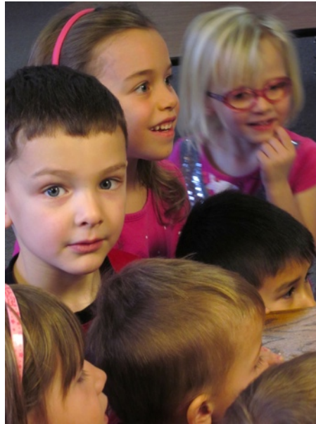
Children at the LaMere Learning Center observe a science experiment performed by their instructor.

This year, SCRIP has been more widely used and more successful than any previous year at St. Mary's. SCRIP are the equivalent of gift cards that can be used for regular purchases from hundreds of local and national companies. St. Mary's purchases the SCRIP at a reduced rate, and then sells the cards at face value. The profits can go towards tuition or directly to the school. Purchase SCRIP at the school office or after weekend masses.