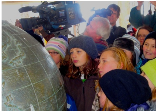
5th grade students observe the sun shining on North Dakota

During the ceremony, the participants reflected on the importance of Veterans' Day, honoring those in past or present service to our country and those who have sacrificed their lives in that service.