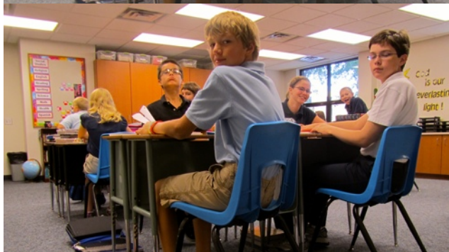
From late July to late August, a locker room transformed into a classroom