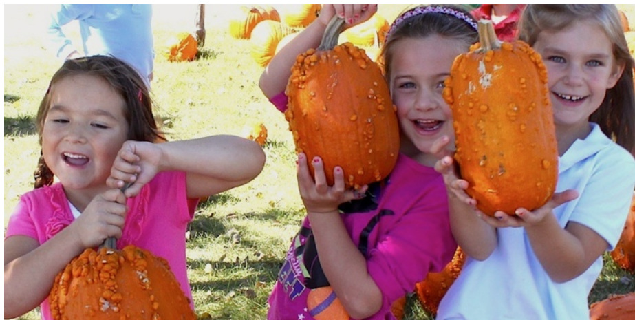
St. Mary's Grade School Kindergarten students hold up some bumpy pumpkins during the afternoon event.