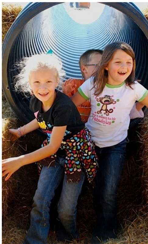
St. Mary's Grade School 1st grade students exiting the slide