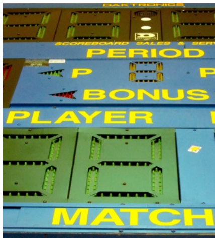
The new scoreboard installed in the gymnasium

page 6 banner photo: 1st grade Pumpkin Art October 11, 2011